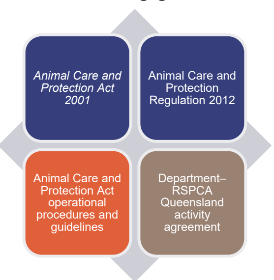
Figure 3A Key enablers of the engagement framework

The department has started addressing some of these limitations since April 2021. It has advised that it will partner with RSPCA Queensland to improve transparency and accountability.