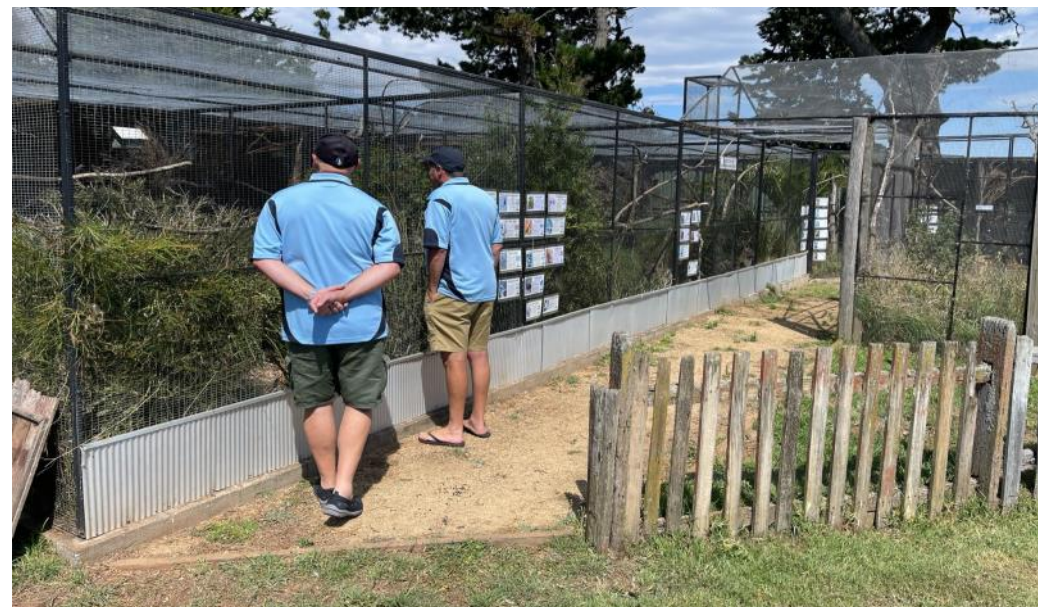
Photo: Aviaries at Taralga Wildlife Park